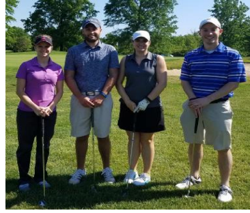
Golf Outing 5/15/17 at Blue Ash Golf Course

6/22/17 Welcome to our New Designees! Happy Hour at Dingle House Irish Pub